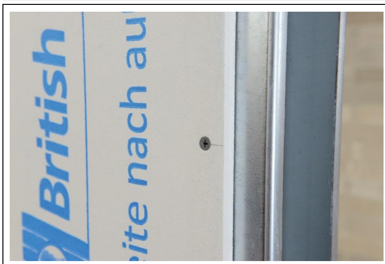
Figure 1 Glasroc X Sheathing Board and Glasroc X Screw

1.2 Items used in conjunction with the boards include: